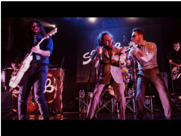
The Bluebeaters 2013